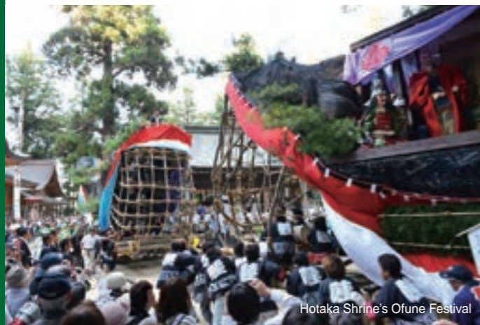
Hotaka Shrine's Ofune Festival

Worship / pray free of charge. Open year-round. TEL 0263-82-2003